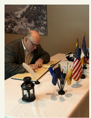
Some of our Compatriots adding their Patriots to the Muster Roll