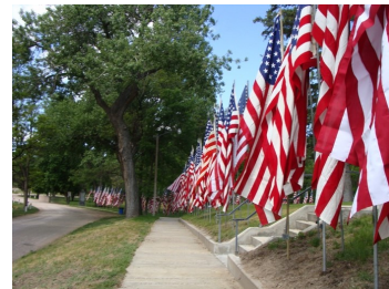
Flag line looking West.

Picture taken at podium is John Dodd American Legion Commander with LaVerne placing reath behind cross next to podium.