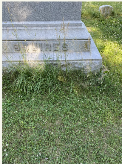
Overgrown grass and weeds around tombstones.