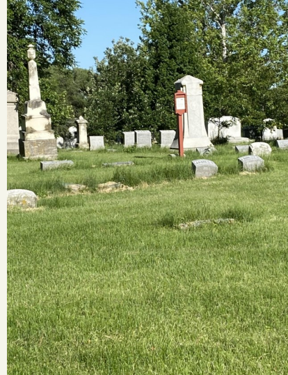
A wider look at part of our site area before we started work.

We are planning on work days, once every month, during the mowing season, probably through September. Our next clean up day is scheduled for Saturday, July 11, at 9am. We can use all the help we can get, so please consider coming out to help on our next clean up day and do this small service for the community as well as to honor those whose final resting places need care and maintenance.