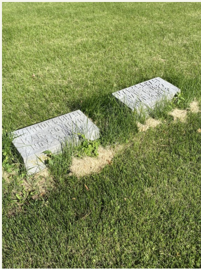
Champion Chase's grave before work began. You can not even see our SAR marker in between the stones.