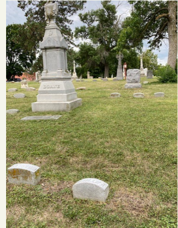
Above: a portion of our section after completion of work

Right: Just a few veterans headstones in need of cleaning and area needing trimmed