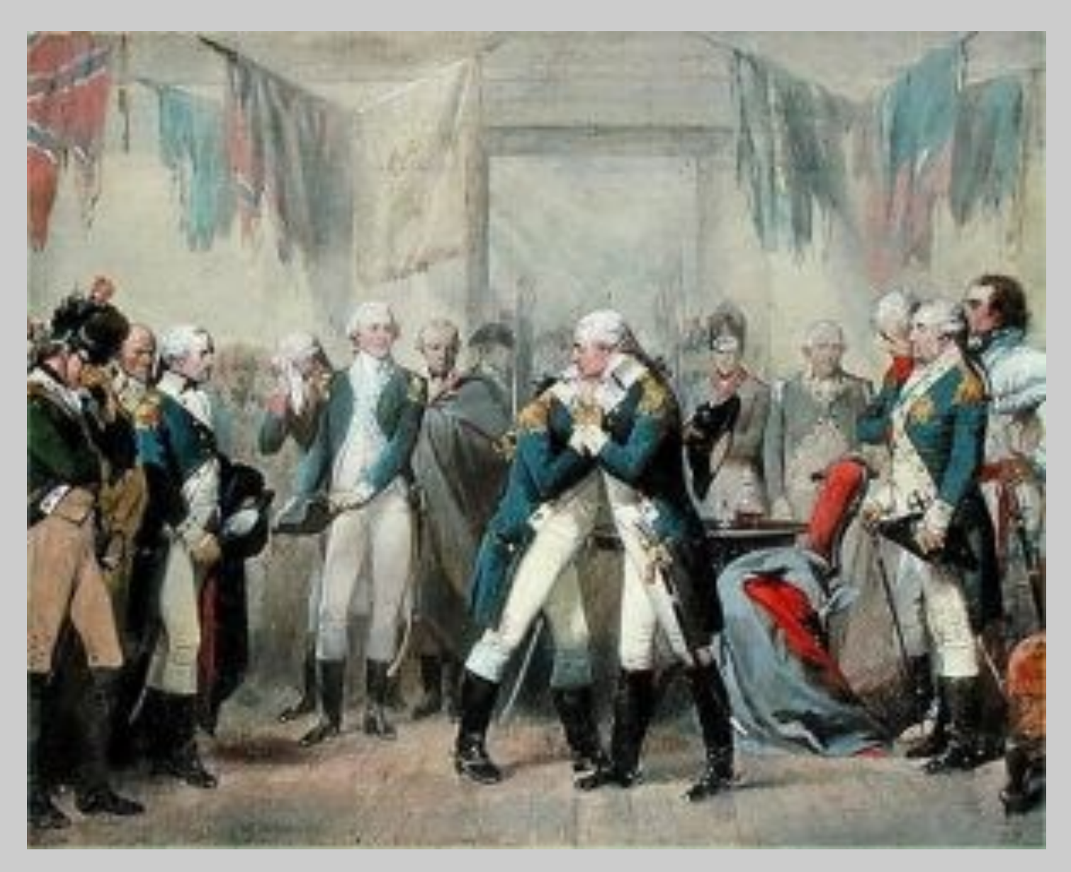
4th Qtr 2020