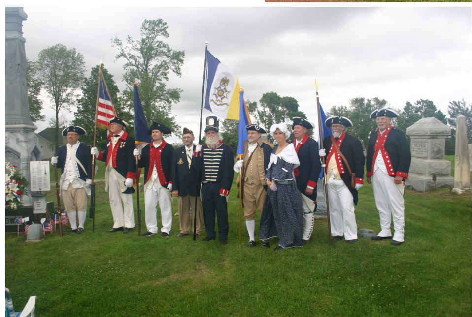
CG Members from Nebraska, Iowa, and Minnesota, including Iowa 1812

it was very warm at the start of the game, and our Omaha Storm Chasers beat the Iowa Cubs, 5-0.