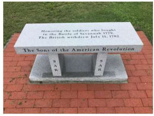
250th Message (All Sites)