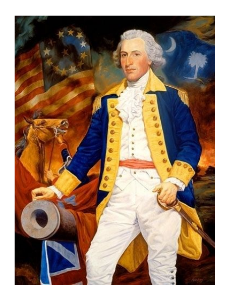
Lt. Colonel Francis Marion "The Swamp Fox"

On September 4, 1780, the Swamp Fox wins the Battle of Blue Savannah.